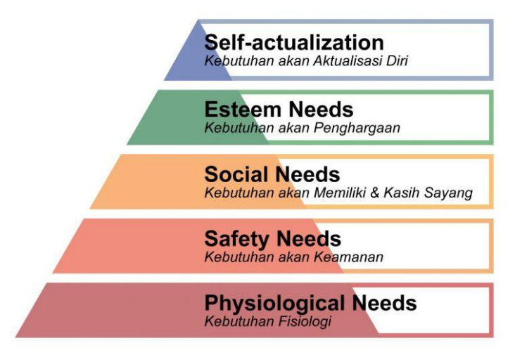
Figure 1 Abraham Maslow's hierarchy of needs

the basis of teaching and learning theory for adults (in Sunhaji, 2014: 3). Adult education aims to organize a systematic and sustainable learning activity with the aim of changes in knowledge, attitudes, values and skills. This is related to the process of improving self-quality, and efforts to solve concrete problems, so that it will ultimately differentiate it from the learning process of children who are resigned to being formed with steps in the form of imitation. Motivation is an important factor in the teaching and learning process. The relationship between adult education and motivation is very strong (Islamic Psychology, 2017). Abraham Maslow, compiled a theory of human motivation which is arranged in a hierarchical or tiered form. Each level of need can be met if the previous level has been satisfied. Narratively, the most basic needs to the highest needs are written as follows: (1) physiological needs; (2) the need for self-actualization. Maslow's theory of motivation is described as follows: