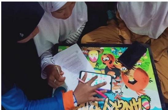
Figure 3. Club House Program/Rumah Belajar