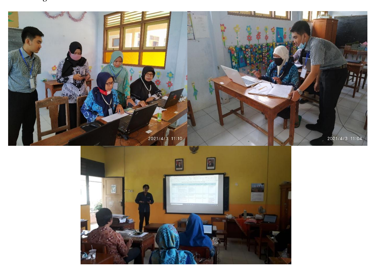
Figure 2. Assistance in Skills Improvement Activities to Build Virtual Learning