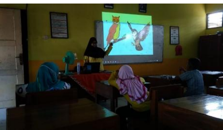
Figure 4. One of Sample of Artificial Intelligence in Learning