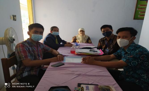
Figure 1. Community Service Implementation Team In SDN Sidorejo Ambal