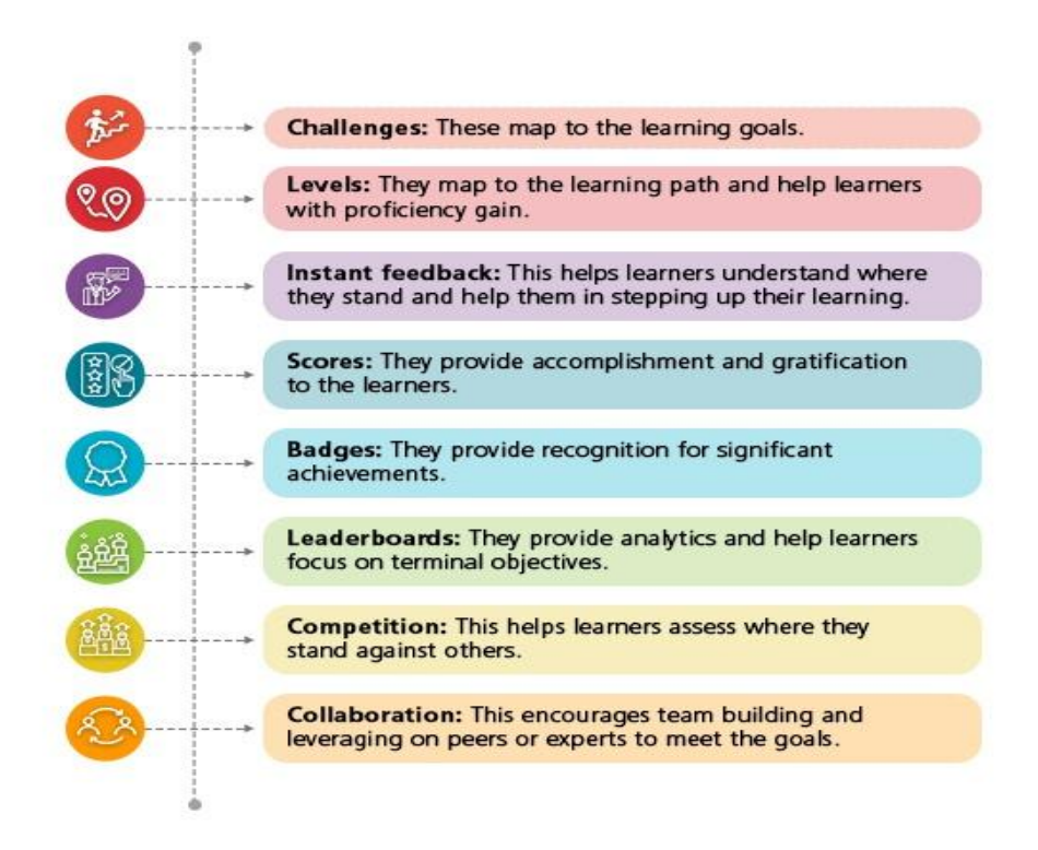
Figure 3. The main elements of gamification in learning.

The main elements of a game that are part of gamification for learning can be seen in the following figure 3.