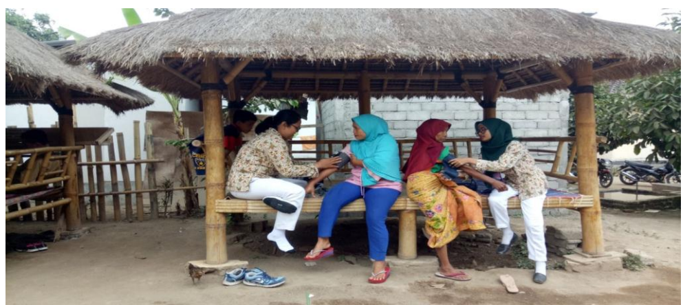
Figure 2: Blood Pressure Measurement

The stages of community service activities are carried out by: taking blood pressure measurements, explaining the benefits of progressive muscle relaxation, providing videos on progressive muscle relaxation, demonstrating to the public about progressive muscle relaxation, the community redemonstrating the implementation of progressive muscle relaxation, providing booklets about implementation of progressive muscle relaxation as an at-home guide to performing progressive muscle relaxation