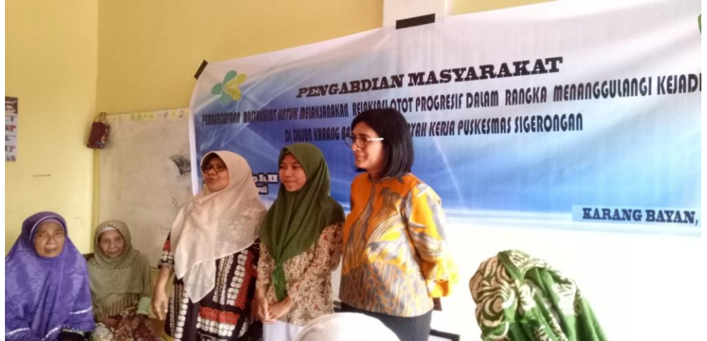
Figure 3: Explains the benefits of Progressive Muscle Relaxation