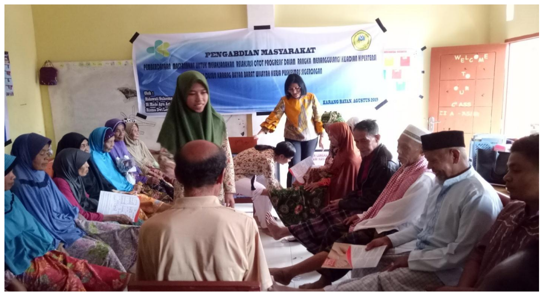
Figure 5: Implementation of Progressive Muscle Relaxation