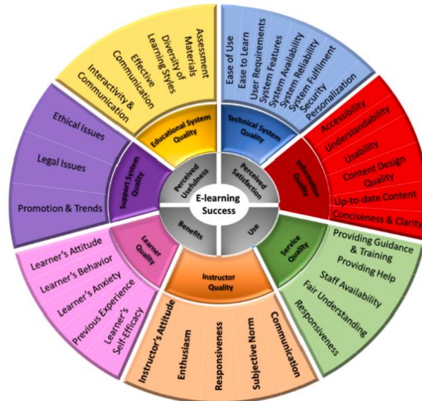
Figure 1. Evaluation Model for evaluating e-learning system success (EESS model) (Al-Fraihat, 2020)